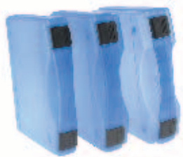
T 2003 S T 2003 M T 2003

The plastic cases TEKNO are nicely shaped and sturdy. Inlays can be created individually. Choose from 17 different sizes, there will be surely one for your needs. Additional to the five standard colours we are able to produce also in individual colours of your company. This is what we call Corporate Design up to the packaging!